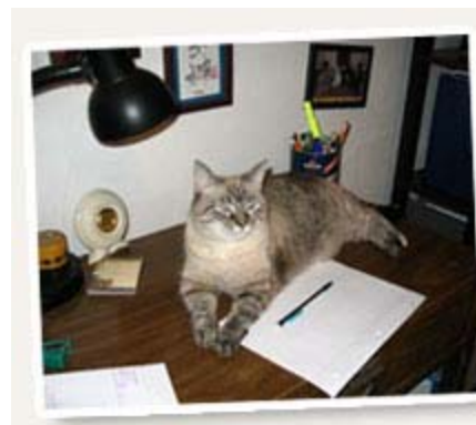
Phoebe, a special weight loss client